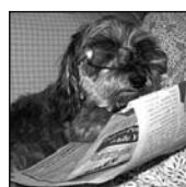
054- Hazel, Roetzel