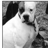
060- Klaira, McKnight