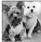
001- Emma & Bella, Walters