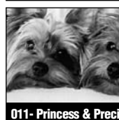
011- Princess & Precious, Miles