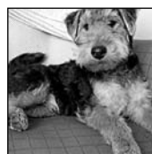
019- Stanlee, Shephard