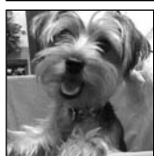
073- Brownie, LaGrove