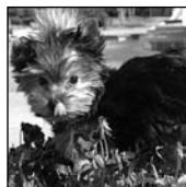
094- Mocha, Slone