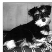
083- Sadie, Huston